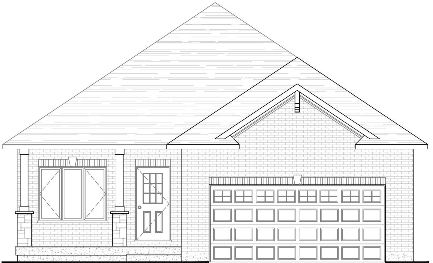
Front Elevation Approximately 1,490 sq.ft. Approximately 36'-6" x 60'-6"